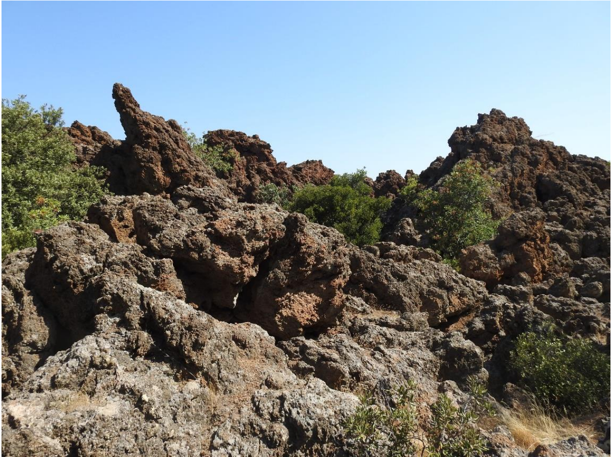
Volcanic landscape on Methana

We will go to the peninsula of Methana by car or bus, depending on the number of participants. We will walk on a narrow path through a special landscape to a volcano. We will have lunch in a small tavern in a village close to the volcano.