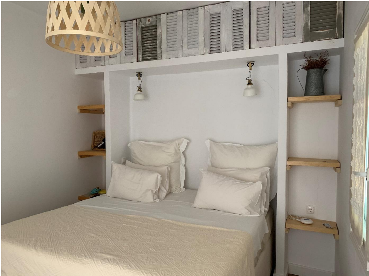
One of the rooms in Odyssey

All rooms have their own bathroom, Wi-Fi, heating and air conditioning. All rooms have a balcony or a terrace with seating. The rooms are recently renovated and all have their own character.